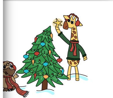
Game 2 - Ds and Es